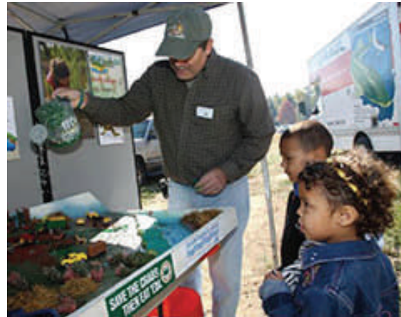
Rain on a watershed model.