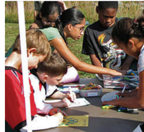
Play games and solve puzzles.